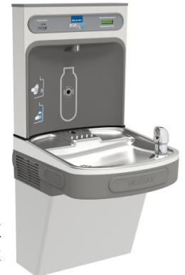
Models LZS8WSVRSK or LZSDWSVRSK